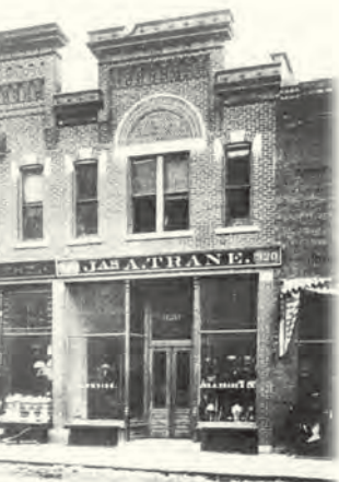
Trane Storefront La Crosse, Wisconsin 1891